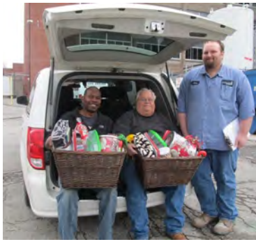
Monsanto Meals on Wheels volunteer drivers getting ready to deliver Christmas Baskets the employees put together for the clients on their route. Thank you Monsanto for all you do!